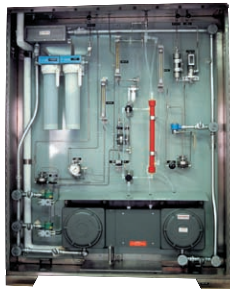
Model 4660 Low Concentration H 2 S Analyzer

AMETEK Western Research Model 4660 utilizes ultraviolet (UV) light-based technology for accurate measurement of low levels of H 2 S. The sample system is designed to completely convert the H 2 S into (NH 4 ) 2 S. The concentration of (NH 4 ) 2 S is then measured with the photometer and is correlated back to the H 2 S concentration. This principle of indirect measurement gives precise measurement and eliminates any possible interferences from unsaturated and aromatic hydrocarbons present in the process stream. The need for costly and maintenance intensive lead acetate tape spools are also eliminated.