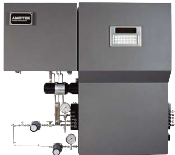
Model 910 Hot/wet Multi-Gas CEM